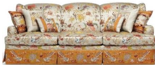
A WOVEN SILK BROCADE UPHOLSTERED SOFA Modern, The Fabric by Prella, Supplied by J.P. Molyneux Studio $3,000–5,000