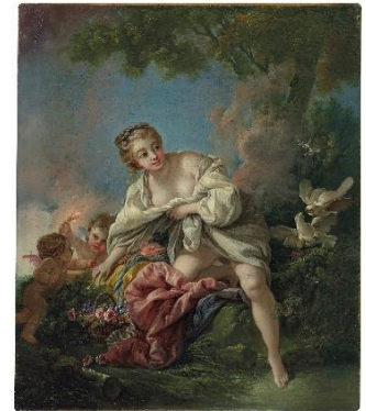
FRANÇOIS BOUCHER (Paris 1703-1770) Vénus et les Amours oil on canvas $150,000-200,000