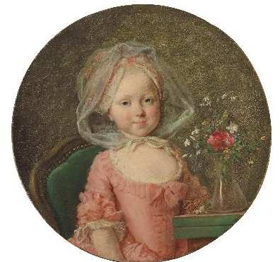
ÉLISABETH-LOUISE VIGÉE LE BRUN (Paris 1755-1842) Portrait of a young girl, half-length last quarter 18 th century $50,000-70,000