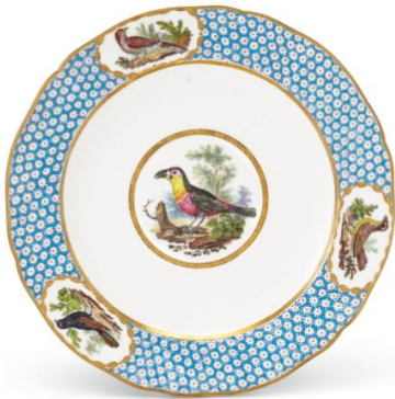
A SEVRES PORCELAIN BLEU CELESTE ‘OEIL DE PERDRIX’ ORNITHOLOGICAL PART DESSERT SERVICE Circa 1782-1786 $120,000 –180,000