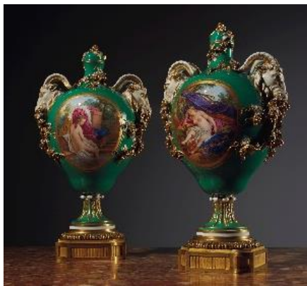
A PAIR OF ORMOLU-MOUNTED SEVRES PORCELAIN GREEN-GROUND VASES AND COVERS (VASE ‘BOUC A RAISINS’) The Porcelain circa 1770, the figure painting almost certainly by Nicolas Dodin, the ormolu bases circa 1820 $80,000-120,000